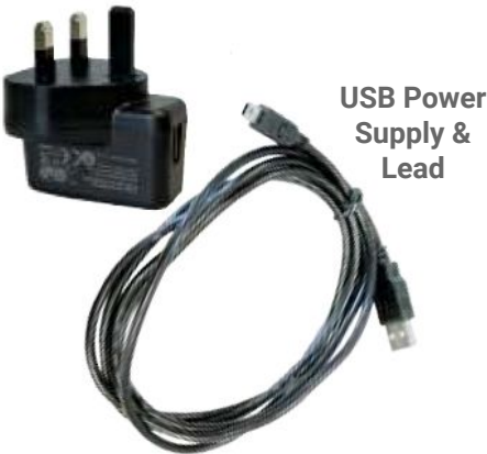
USB Power Supply & Lead